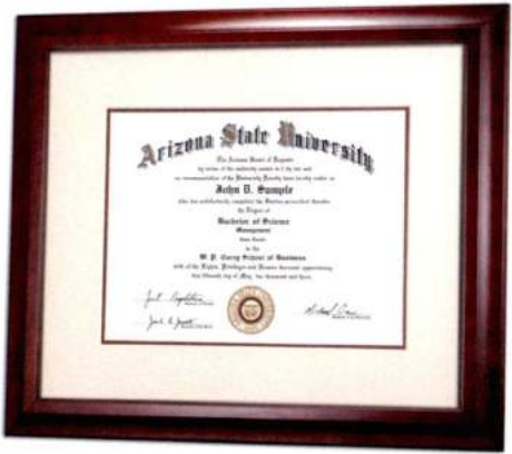
MAHOGANY - LINEN MAT